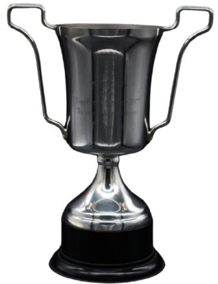
WoolWorths Supplier Of The Year Cup 2007