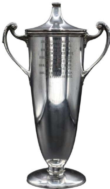
P.A. Briers Cup 1955