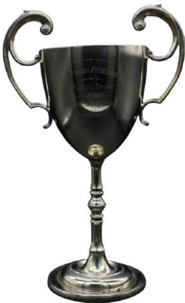
The Frank Myburgh Cup 1949