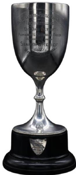
Permanente Floterende Cup 1949