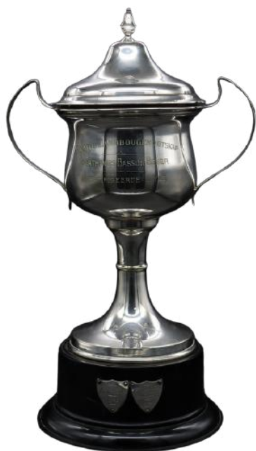
Marthinus Basson Cup 1948